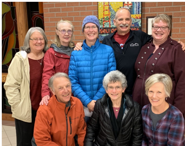
Group from CLF that attended the Bishop's Listen, Learn, and Care Session on October 22.

With one gift, you can help a family escape the cycle of hunger and poverty for good. Contributions can also be made toward projects such as safe water development and educational opportunities. There will be a table set up in the Narthex on those dates to help you select your gifts.